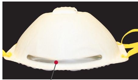
Adjustable aluminum nose bridge for a more secure fit