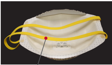
Double elastic comfort fit straps