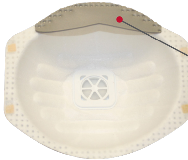
Soft foam nose for extra comfort